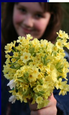
Just a little way to say thank you.